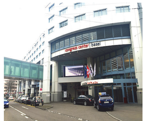
Swissôtel Le Plaza**** and Congress Center under the same Roof