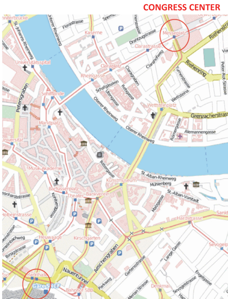
Railway Station SBB

Coming from Zürich Airport: There are frequent trains between Basel SBB station and Zurich Airport taking less than an hour. You arrive in Basel at the Swiss Train Station and proceed as described above